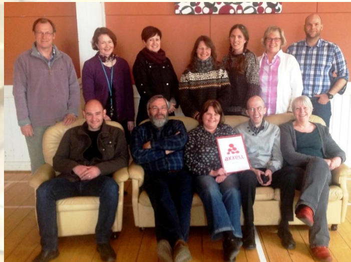
Partner Meeting 4 in Finland

Internet: http://workmentor.vma.is http://www.workmentor.eu