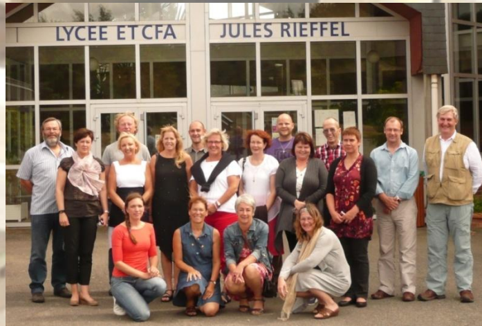
Partner Meeting 3 in Frankrijk